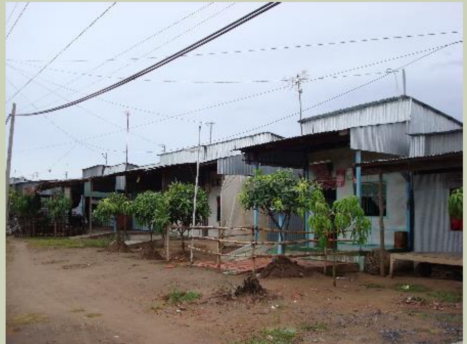
Relocation site, Long Thuan province